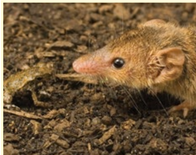
Native mammals like this planigale have an aversion to eating toads.