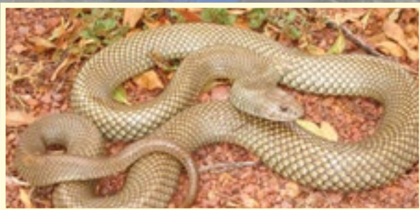
Mulga snake.